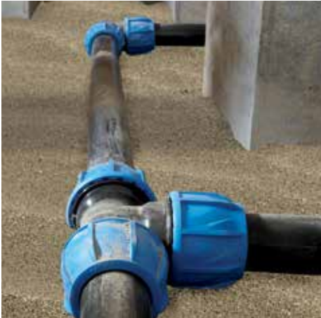
Water Distribution Lines